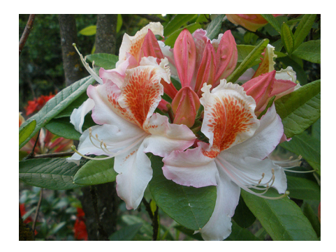
R. 'Jock Brydon'.

It was the importation of R. occidentale to the UK in 1850 that has ultimately given us the large flower size on our Knap Hill and Exbury hybrid deciduous azaleas. They are a useful addition to any garden as they are late flowering and scented. Many have wonderfully coloured leaves in the autumn. Equally, there are fine Dutch and Belgian hybrids too, e.g.,