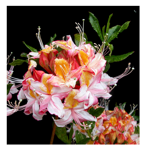
R. occidentale SM303.