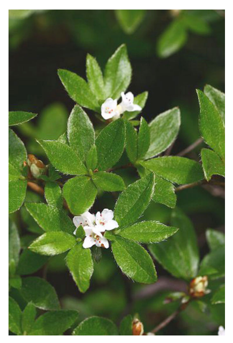
R. tschonoskii var. tschonoskii . No photo credit.

<u>Rhododendron tschonoskii var. tschonoskii (Kome Tsutsuji)</u>: The branchlets, petioles, and leaves on both surfaces (especially midrib) are heavily covered in long, adpressed, brown, strigose hairs. Elliptic leaves are 0.5 to 2.5 cm (0.2-1 in) long and 0.5 to 1 cm (0.2-0.4 in) wide. The underside of the leaf has four to five somewhat prominent lateral nerves.