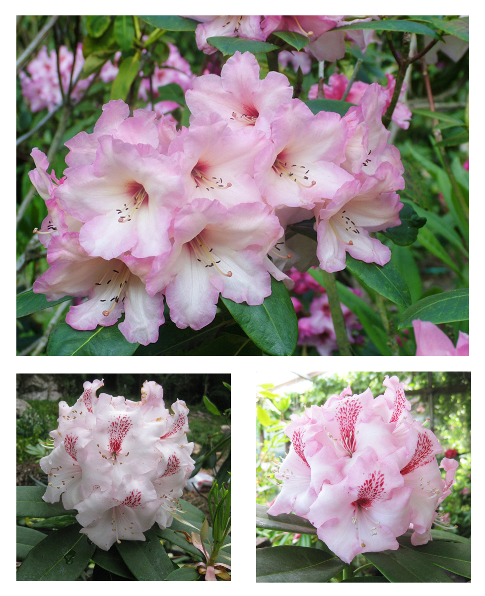
Fig. 6. Offspring rhododendrons 'Kenneth Hulme' (bottom left) and 'Barbara Hulme' (bottom right) from unnamed parent seedling (top).

complex parents, as it is impossible to list the many millions of genetic influences available within a genus of over a thousand species. Some will be dominant and some recessive, varying from flower colour and form, leaf shape, susceptibility to disease etc. If we cross pollinate two rhododendrons without any knowledge of their genetic parenthood, it is like expecting to win the National Lottery every