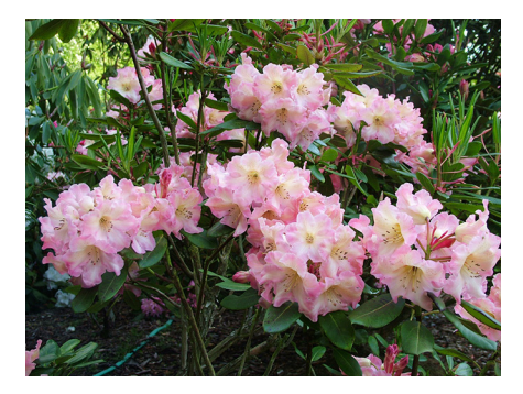
Fig. 5. Rhododendron 'Harwood Dale' ('Loder's White' X 'Thor') - one of the author's early unregistered hybrids.

One of my most useful tools for deciding which parents to use has been Homer E. Salley and Harold E. Greer's book "Rhododendron Hybrids – A Guide to their Origins." This book is the standard guide to the parentage of some 4000 registered hybrid rhododendrons and is extremely valuable to rhododendron hybridisers and professional growers alike. Choosing parents is not an exact science, particularly choosing ones with