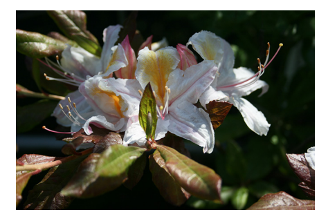
R. occidentale 'Stagecoach Peppermint'.

Stagecoach Hill Azalea Reserve is a must, especially if you can only visit one place. The variations within this species can be seen at first hand.