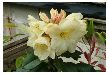
Fig. 4. Seedling Rhododendron 'Chris's Cream' held by its namesake (left), and close-up of flower truss opening for the very first time (right).

quality, plant hardiness, and disease resistance, particularly powdery mildew are actively being sought and this must start with the selection of good parents. But before we evaluate these, a note on my choice of parentage.