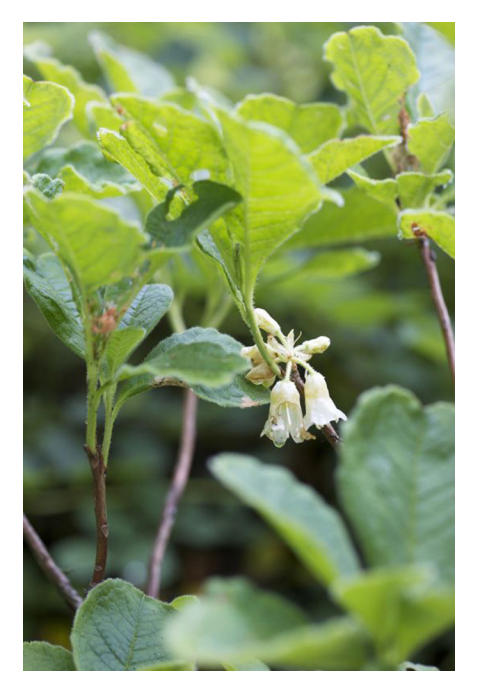
R. nipponicum.

Rhododendron nipponicum is considered one of the most primitive species in the genus Rhododendron . It is endemic to Japan and grows at 900 to 1300 m (3000 to 4250 m) in woods and thickets on the western side of northern Honshu from Akita prefecture to Fukui prefecture, where heavy snowfall is present. It grows with Rhododendron multiflorum (Menziesia multiflora) and Rhododendron