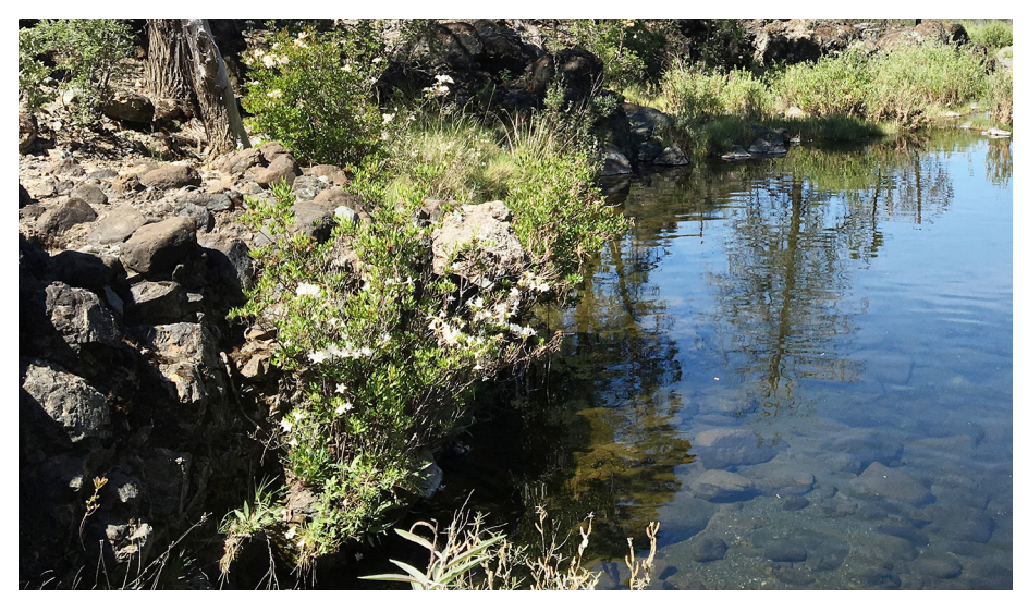
Rhododendron occidentale growing by Hunting Creek, California.

(Reprinted from the RHS Group Rhododendrons, Camellias & Magnolias 2019: 15-26.)