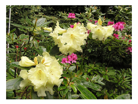
Fig. 3. Rhododendron 'Sunspray'.

Should there always be a goal when hybridising? This is the main point emphasised by most hybridisers, but as an amateur just having fun, I have ignored this advice. The broad aims of rhododendron breeding programs have changed little from those of the past. Improvements in flower and plant