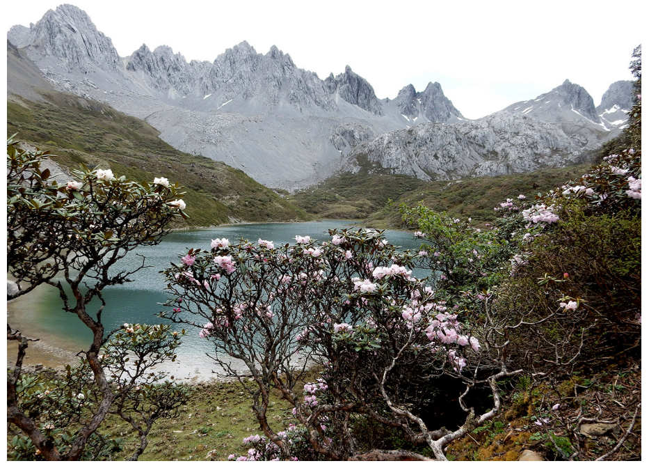
Rhododendron adenogynum, Tianbao Shan, North-west Yunnan.

complicate the situation, in many cases the applicable rules have not yet been worked out. These are still early days for Nagoya and countries are still in the process of implementing provisions. This issue is exemplified by China, one of the world's so-called "megadiverse" countries<sup>15</sup> and a rich hunting ground for, amongst others, enthusiasts of rhododendrons, camellias and magnolias. As of November 2017, although China has made progress on implementing Nagoya, systems to facilitate the granting of prior informed consent and agreement of mutually agreed terms had yet to be put in place. Similarly, so far there is no mechanism to allow for the issuing of compliance certificates at the ABSCH<sup>16</sup>.