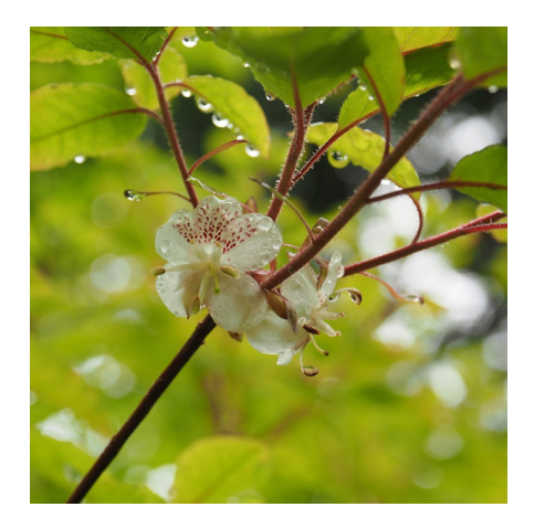
R. semibarbatum. Botanical Gardens, Graduate School of Science, The University of Tokyo.

Southern Hokkaido, Honshu, Shikoku, and Kyushu (Yaku Island). It tends to be found at the edge of deciduous forests or on sunny slopes, at low elevations from 300 to 1400 m (985 to 4590 ft). It is considered a rare species in Japan.