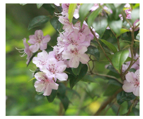
R. uwaense.

Prefecture in Western Shikoku, where this species was discovered. It is a member of subgenus Azaleastrum, section Azaleastrum, which includes Rhododendron ovatum, Rhododendron Rhododendron honkongense, and leptothrium, for example. What is interesting is that the closest relative of this species, R. ovatum, occurs in China and Taiwan, making R. uwaense a geographically isolated species. R. uwaense occurs in the eastern and northern limit of section Azaleastrum. The only location in which it is known