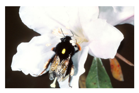
Fig. 1. Bombus eximius.

In one study in Thailand, Kjellsson et al. (1985) have shown that the large flowers of R. lyi are pollinated by B. eximius (Fig. 2), a large species that is uncommon but widely distributed throughout east and south Asia. Glen Jamieson (pers. comm.), on the other hand, has observed sunbirds family Nectariniidae, 132 species in 15 genera; counterparts to two very distantly