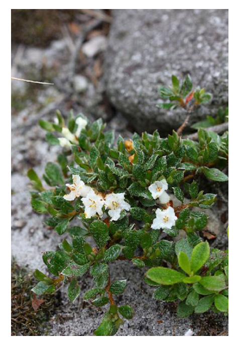
R. tschonoskii var. tetramerum. No photo credit.

Rhododendron tsusiophyllum is a dwarf evergreen azalea that is native to the island of Honshu in Japan. It grows in eastern Honshu from Kanagawa to Saitama, as well as adjacent islands such as Mikura Island of Tokyo prefecture. The height of a mature plant is only 20 to 60 cm (8-24 in) tall. In the wild, it occurs on rocky slopes, where it has a prostrate growth habit. It was formerly considered as a different genus, Tsusiophyllum tanakae , due to the three-locular ovary and anthers that