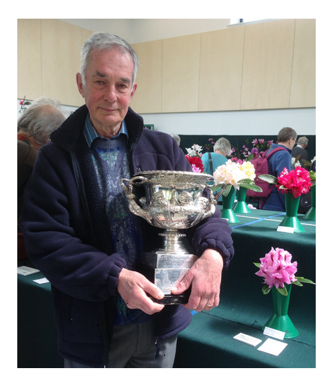
Fig. 8. Author holding the Crosfield Challene Cup at the Main Rhododendron competition 2017, winning with three unnamed rhododendron hybrids.

been exposed to the pathogen due to the pathogen's scarcity, and then only appeared once the plant was in general cultivation. It is therefore important that we eliminate this disease by only introducing disease resistant plants and let those hybrids that are not resistant just fade away. There are made fine hybrids available, powdery mildew free, that have superseded them.