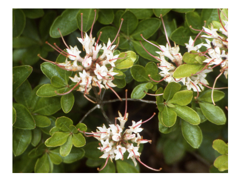
R. occidentale SM157 'Mini Skirt'.