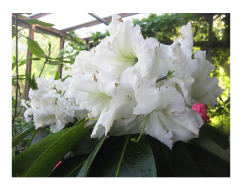
Fig. 7. Unnamed seedling derived from Rhododendron 'Fagetter's favourite'.

time we purchase a ticket. So, you need to study the ancestors of a plant and have a basic understanding of plant genetics to decide. A good example is crossing a species red flower with a species yellow to produce an orange. This does not happen because the colour red is a dominant gene and you are most likely to end up with pink hybrids rather any orange flowers. Also, if red is a dominant gene and you don't want red flowers, don't use parents that have red flowers!