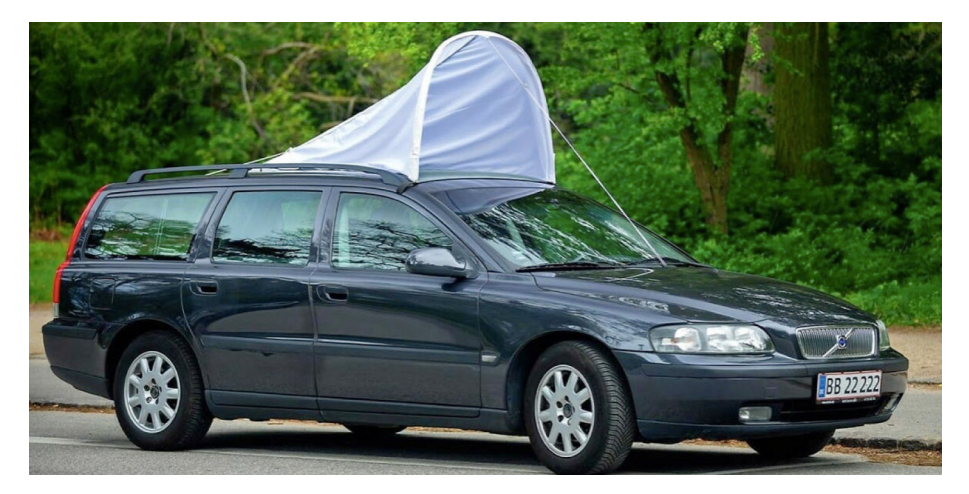
In project "Insect Mobile," insects are caught in an open, forward-facing net attached to the roof of the cars. Data will be in the form of insects.