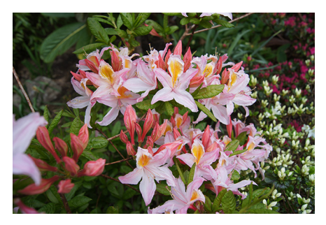
R. 'Irene Koster'.

To grow R. occidentale in UK gardens, humus rich, acid soil with a pH of 6.5 or less is needed and adequate, but not necessarily copious amounts of water for it to thrive. Humidity does appear to be an issue both in cultivation and in the wild; wild growing plants in coastal regions, with higher humidity, are taller than those growing inland where the humidity is lower. R. occidentale will grow in full sun or partial shade but as it is a late flowering species, typically June, extreme heat will cause the flowers to collapse. Planting near water sources such as streams, ditches or ponds will improve the relative humidity near the flowers and extend