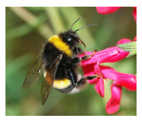
Fig. 1. Bombus terrestris.

Australia and New Zealand are a particularly interesting region for studying the relationship between bumblebees and rhododendrons. Excluding the two vireya species that occur in isolated populations in the mountains of Queensland, there are no native bumblebees or rhododendrons in Australasia. Rhododendrons, however, have been introduced into gardens in New Zealand and into the southern