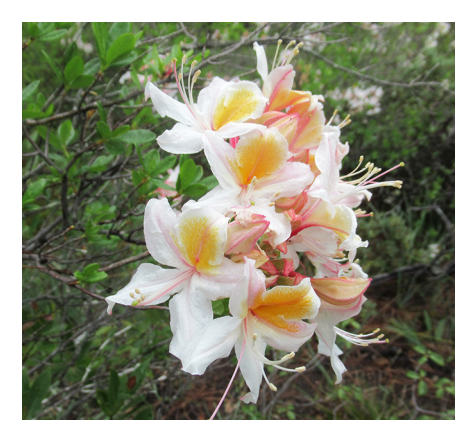
R. occidentale (Siskyou 3901).