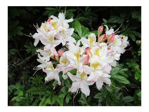
R. occidentale (P027 Patrick's Point 3806).