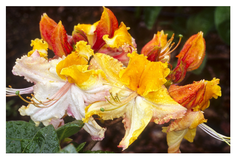
R. 'Washington State Centennial'.