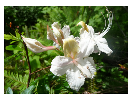
R. occidentale GG1 at Flynn Creek.