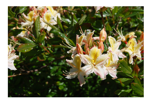
R. occidentale 'Stagecoach Cream' (Data.rbge.org.uk/living/19750138A).

the geographical limitations we see are caused by mycorrhizal association or by some other mechanism.