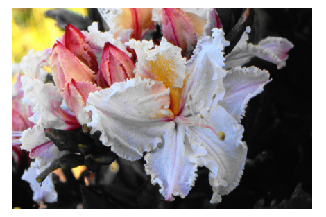
R. occidentale 'Stagecoach Frills'.