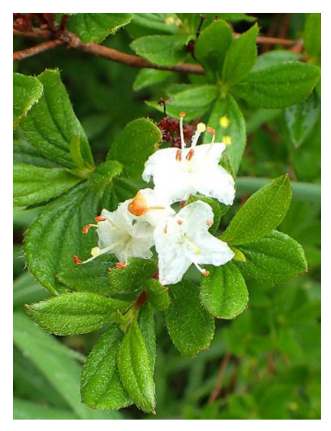
R. tschonoskii var. tetramerum. No photo credit.

<u>Rhododendron tschonoskii var. trinerve (Ookome Tsutsuji):</u> Similar to var. tschonoskii, its leaves and flowers are slightly larger in size. In fact, "Ookome