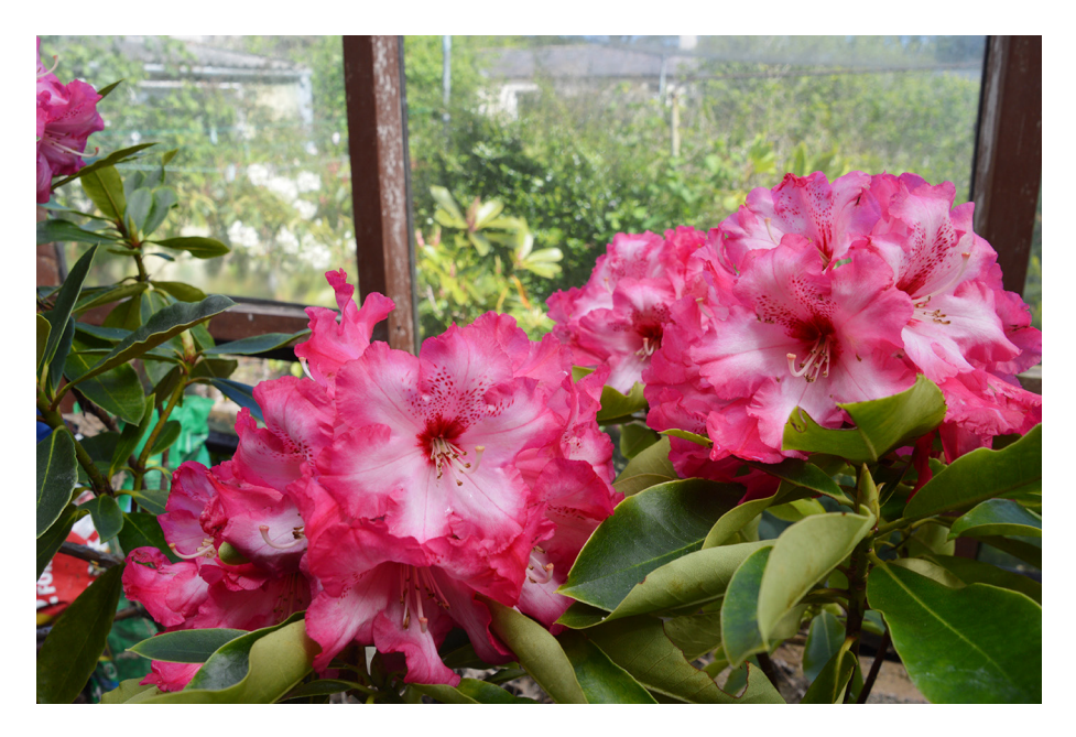
Fig. 9. One of the winning unnamed seedlings from the Crossfield Challenge Cup 2017.

This is a difficult one for me. Most hardy rhododendrons will survive temperatures down to -15° C and by choosing parents that are hardy one hopes that their offspring too will indeed be cold resistant. I believe I am safe to presume that my hybrids