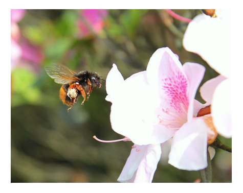
Fig. 3. Bombus polaris in Taiwan.

Irving and Hebda (1993) have written about the evolution of the genus Rhododendron , but not about the evolutionary relationship of Rhododendron and other ericaceous plants such as the heathers, cranberries and similar genera with the genus Bombus (Fig. 3). There are a number of reasons to believe that that rhododendrons and bumblebees may have co-evolved. Firstly, both groups naturally occur in the Northern Hemisphere in Eurasia and North America but are absent from Africa, India and Australasia and much of the lowland tropics. The exception is that bumblebees occur in the Southern Hemisphere only in South America where there are no rhododendrons. This suggests that bumblebees may have migrated south along the cooler mountain backbone of Central America