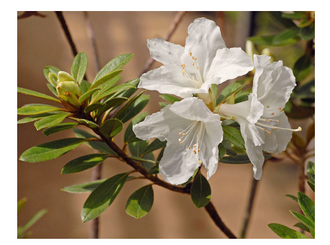
R. boninense.

It has been reported that this species is extremely difficult to grow outside the Ogasawara archipelago due to the lack of laterite (clay that is rich in iron and aluminum) that naturally occurs in the region. It belongs in subgenus Tsutsusi , section Tsutsusi , and the closest relative of this species is Rhododendron scabrum which also is found in Japan. The species name " boninense " comes from the word "Bonin" the other name for the Ogasawara archipelago. In fact, there are several genera that occur in the region with the same species name, including