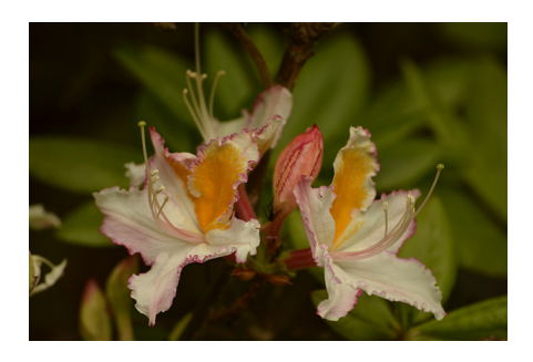
R. occidentale grown from wild collected material (Data.rbge.org. uk/living/19741728A).

It is the view of Mike Oliver that R. occidentale also needs the correct mycorrhiza to prosper: "Ericaceous plants need the association of the mycorrhiza Hymenoscyphus ericae to prosper at all. If the strains of this in the west coast of the USA and in Europe are compatible with R. occidentale they will grow, but if the strains available are not compatible, they will not grow. It should be noted that another ericaceous plant, R. macrophyllum, grows in the west but is unable to grow in the south-eastern USA" (M. Oliver, pers. comm.). Clearly further investigation is needed here in order to confirm if