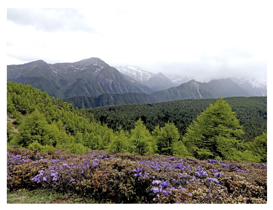
Lapponica rhododendrons, Beima Shan, North-west Yunnan.

Furthermore, the Protocol brought about the existence of the Access and Benefit-Sharing Clearing-House (ABSCH) for sharing information relating to access and benefit-sharing, including details of focal points and competent authorities. The Clearing House also serves as a database of information relating to what genetic resources are accessed where; when a country grants access to its resources, the ABSCH will publish details of the permit and also publish an internationally recognised certificate of compliance, which users can then use to demonstrate their compliance.