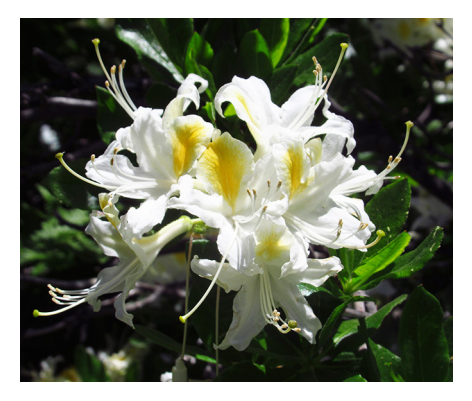
R. occidentale (Palomar 1318).

D hododendron occidentale is a species \mathbf{K} of deciduous azalea from the USA. Since this species was discovered, its value as a parent in hybridisation Europe and programmes in particularly in the UK, was recognised almost immediately. However, it wasn't until the 1950s that American plantsmen became really fascinated by R. occidentale. Since then, interest has grown apace and today there are numerous plant hunters and groups of enthusiasts that trek, every year,