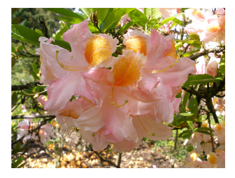
R. 'Exquisitum'.

In the wild R. occidentale can tolerate a high pH in soils or water. In the serpentine soils where R. occidentale grows, the pH of up to 8.5 is high, not because of calcium content but because of the magnesium and iron content. Experiments in the USA have used R. occidentale as grafting stocks onto which were successfully grafted Rhododendron scions (Slosson Reports 1998, 1999).