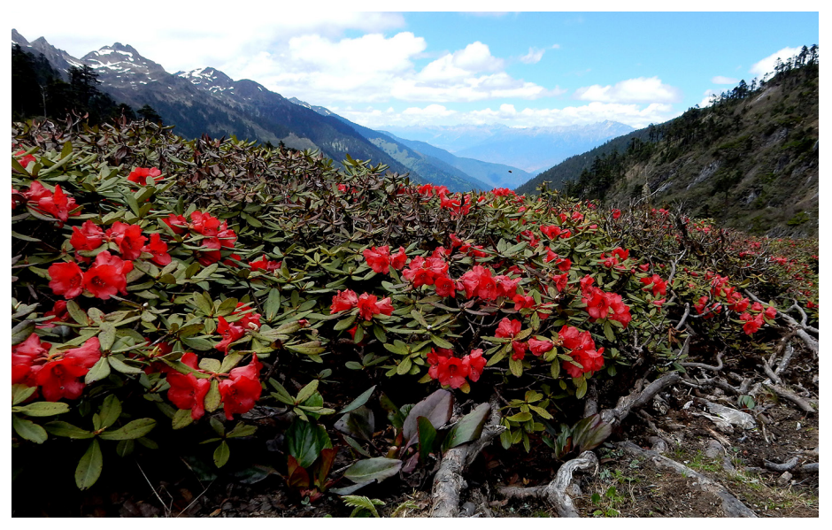
Rhododendron neriiflorum, Salween-Mekong Divide, North-west Yunnan.

(Reprinted from the RHS Group Rhododendrons, Camellias & Magnolias 2018: 84-89.)