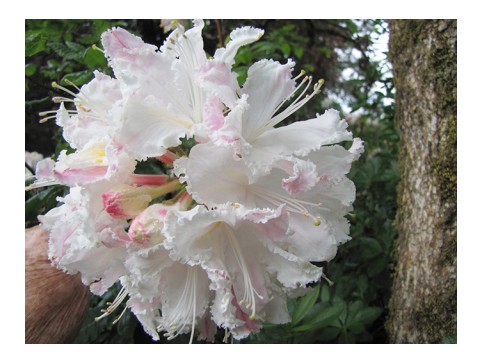
R. occidentale 'Frank Mossman'.

all crowded into thickets, millions of fragrant flowers. Nothing in my former experiences had prepared me for this. It was a bit frustrating to an inexperienced plant collector who had ambitions to accomplish something definite. But it was an essential beginning, and it had to happen in just about that way. It taught me that I knew little, valuable information this when one faces a big task, and I was convinced that my R. occidentale