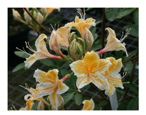
R. occidentale SM030 'Crescent City Gold'.