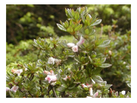
R. tschonoskii var. tetramerum. No credit credit.

like, flowers), this plant has white to flushed pink, four-lobed flowers, rarely five-lobed. Tiny tubular-campanulate flowers are only 5 to 7 mm (0.2-0.28 in) long (and 5 to 6 mm (0.2-0.24 in) wide. The lobes are only 2 to 3 mm (0.8-0.12 in) long, which makes them shorter than the corolla tube. The pedicel is 2 to 4.5 mm (0.8-0.18 in) long. There are four stamens that do not exceed the length of the corolla. Its branches crawl on the ground so the overall size is much