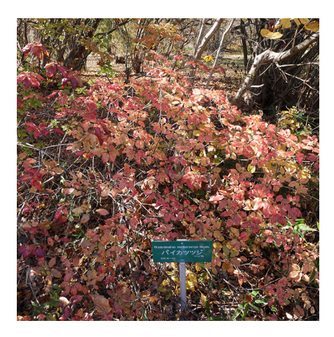
R. semibarbatum fall foliage. No photo credit.